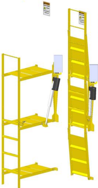
Powered Retracta Ladder® Extends 36" from wall