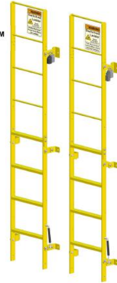
SmartLadder™ Weight-activated switched ladder