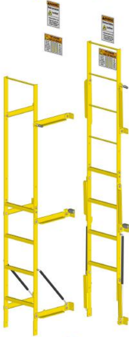
Extended Retracta Ladder® Extends 18" or 24" from wall; retracts to less than 4"