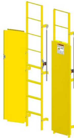
SmartGate Ladder™ Switched gated ladder