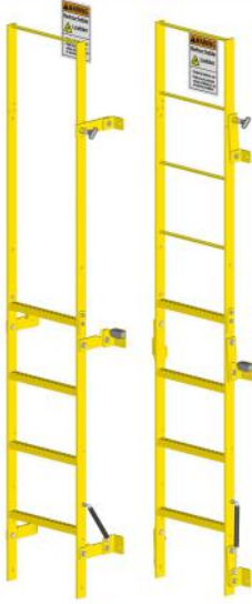
Retracta Ladder® Extends 7" from wall; retracts to less than 3"